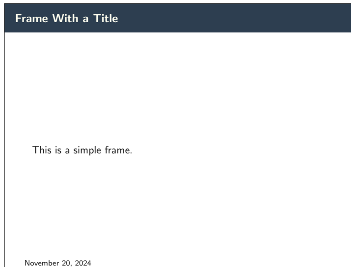
Figure 1: A simple example.

For best results, we recommend installing the fonts Fira Sans and Fira Mono and compiling with Gotham using XeLaTeX or LuaTeX. These are optional dependencies; Gotham is compatible with (e.g.) pdfL A T E X and will fall back to standard fonts if Fira Sans or Fira Mono is not installed.